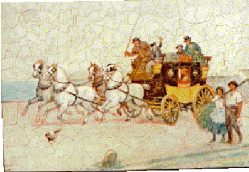
David Copperfield Leaving Margate. 1933.