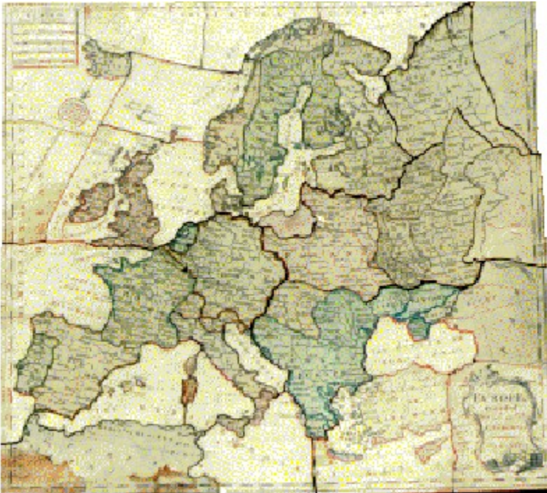
Europe Divided Into Its Kingdoms. Circa 1766.

The first jigsaw puzzles were "dissected maps," produced by map makers as educational devices to teach geography to children. John Spilsbury of London is credited by many with inventing the jigsaw puzzle around 1762. The Amsterdam firm of Covens & Mortier also made map puzzles in the mid-eighteenth century, but researchers have not yet been able to pinpoint the exact date when they began (Bekkering & Bekkering, 1988).