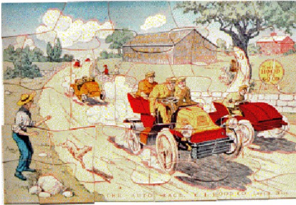
The Auto Race. Circa 1910.

The popularity of puzzles took a quantum leap when business rediscovered the puzzle as an advertising medium. Advertising puzzles had been used to some extent since the 1880s. Merchants and manufacturers gave these puzzles away as free premiums to consumers who bought their products. What better way to keep a brand name before the public than to have them working for hours to assemble a picture of the product?